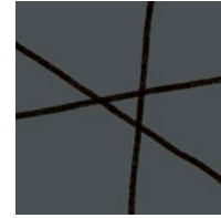
Black/Pewter - LN005-2