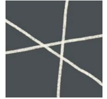
Swiss/Pewter - LN005-3

We print to fit your specific wall size, therefore each order is individually priced. Each mural is broken down into panels that are approximately 48" wide. Installation is straightforward with marked, sequential panels that are easily double-cut on the wall. Please reference your project name and wall dimensions when requesting a quote.